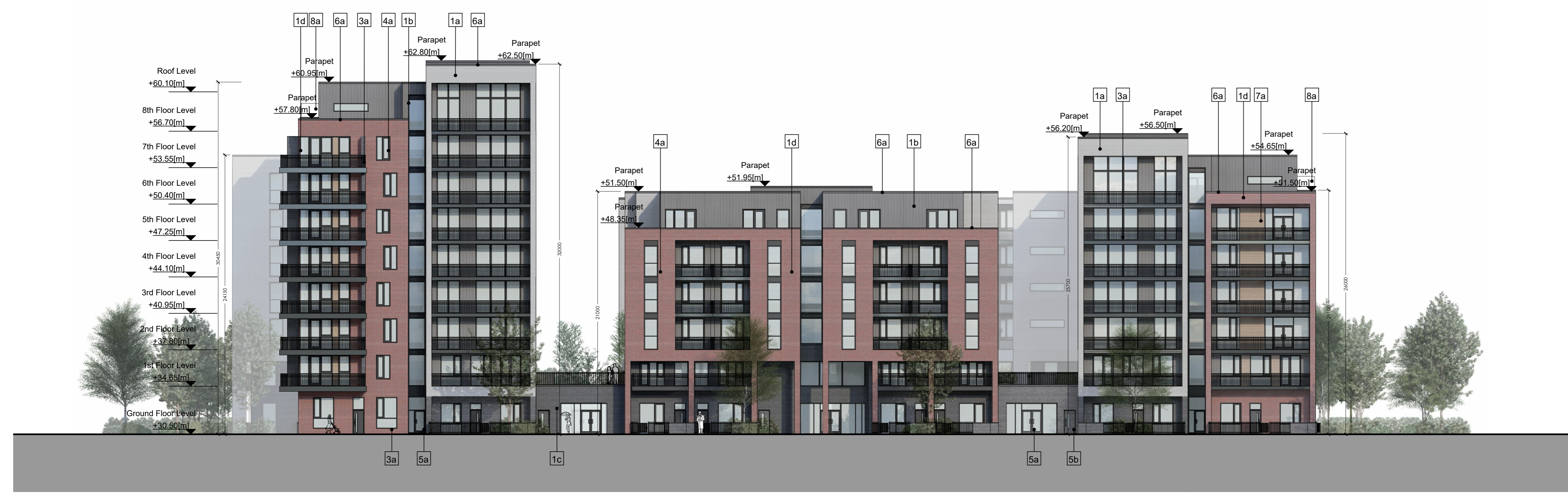
01 - South Elevation - Block 1