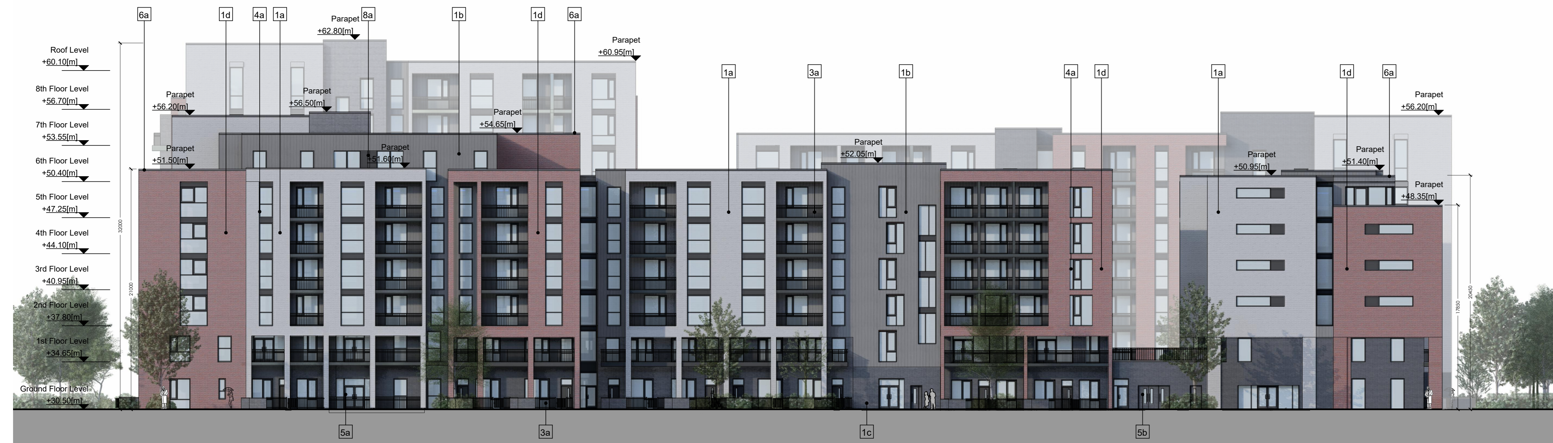
02 - East Elevation - Block 1