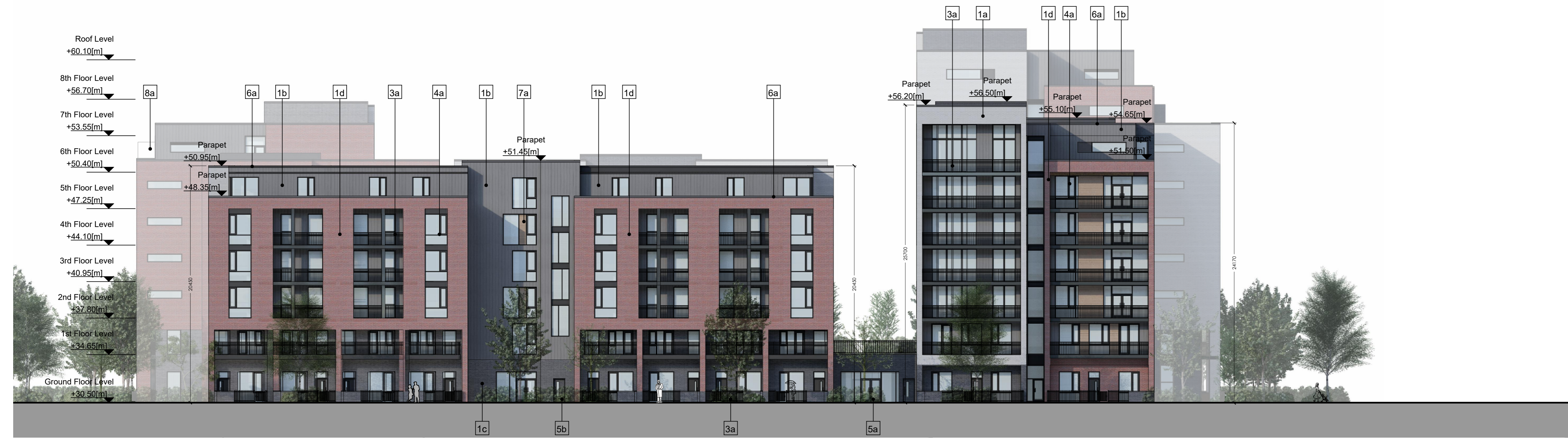
03 - North Elevation - Block 1